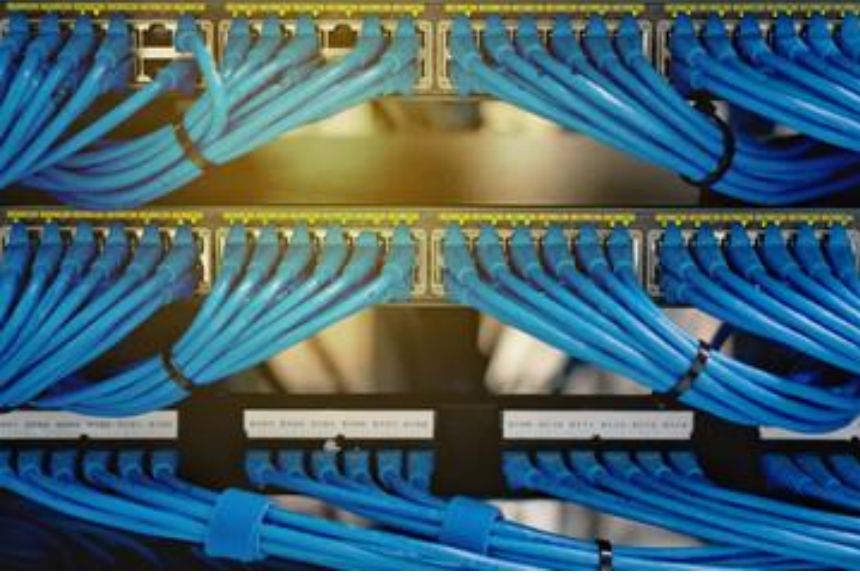
CAT6 SF/UTP SERIES